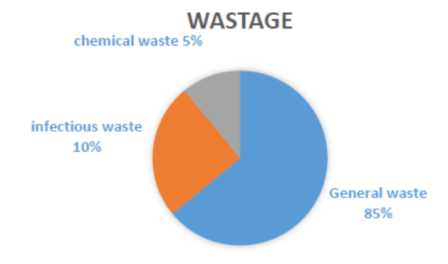
Figure 4.1. Percentage of different types of wastages